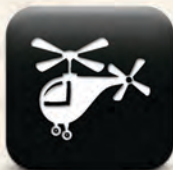
Helicopter "Fly-In" Rig