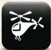
Helicopter "Fly-In" Rig